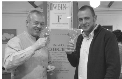
Two people who understand both wine and pleasure

Of course we have translated the wine descriptions into many different languages in order to bring our international guests closer to German wines.